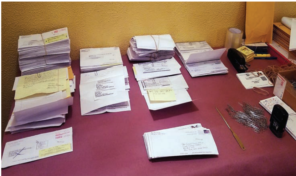
Temporary mailroom set up by the A.A.W.S. mail/shipping supervisor in his apartment in the Bronx. The daily mail includes literature orders, contributions, update correspondence and inmate mail.